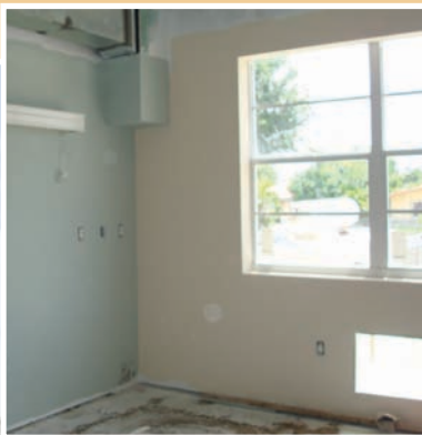
One of twenty private rooms and suites