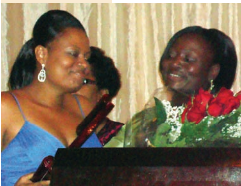
Honored as HANA's 2008 Nurse of the Year