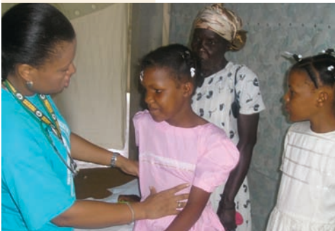
On a medical mission trip to Haiti

that I can learn, whether it is for my job or to help others, I am always looking at learning new things."